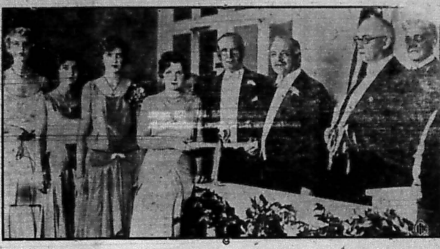
Vice-President Charles Curtis distributing diplomas to the graduates of the Pierce School of Business Administration following his address on world peace at the commencement exercises in the Academy of Music, Philadelphia, Pa.