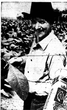
Mild ripe home-grown tobacco in Chesterfield Cigarettes.