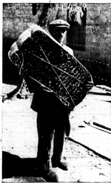
A halt of ornate Chesterfield tobacco.