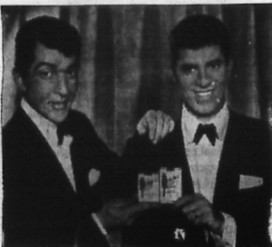
MARTIN AND LEWIS—CAMPUS FAVORITES

Chesterfield-favorite cigarettes on the college campus—continues this year to bring college students everywhere their favorites in the world of entertainment. Biggest added attraction to Chesterfield's all-star line-up this fall is the new Chesterfield Martin and Lewis show on the NBC coast-to-coast network every Tuesday night. Dean Martin and Jerry Lewis are the hottest comedy team in the nation and one of the top attractions on the college campus.