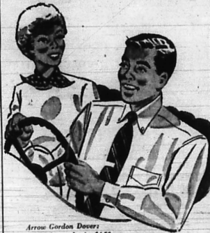
Arrow Gordon Oxfords button-down classic, $4.50.

The most dashing men on campus wear Arrow Gordon Oxfords