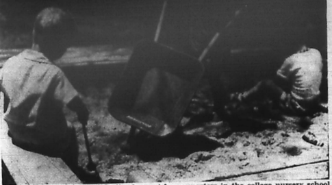
THE SAND BOX is a favorite play spot for youngsters in the college nursery school. Eleven children are attending the school under Home Economics department supervision.