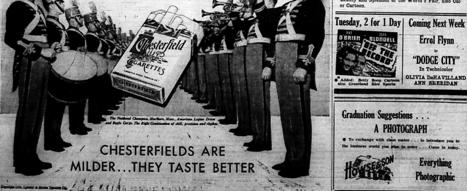
Copyright 1939, Liggett & Myers Tobacco Co.

When you try them you'll know why Chesterfields satisfy legions of smokers from coast to coast