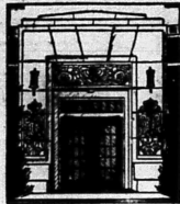
FRIENDS OF THE LIBRARY COLLECTION PRESENTED BY