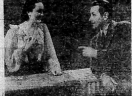
Monday Today and Thursday at the... of the... New York... featuring...