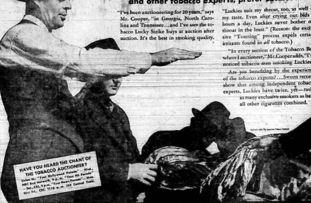
WITH MEN WHO KNOW TOBACCO BEST - IT'S LUCKIES 2 TO 1

"The most handsome young man seen the beginning of an American marriage..."