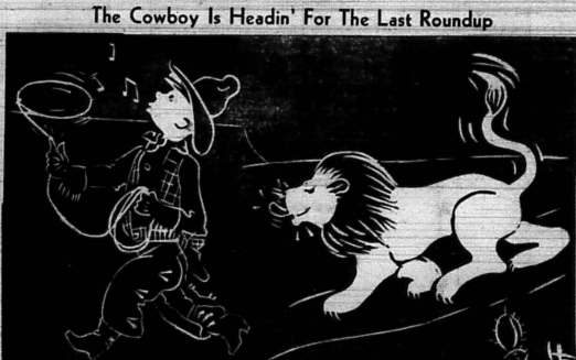
The Cowboy Is Headin' For The Last Roundup