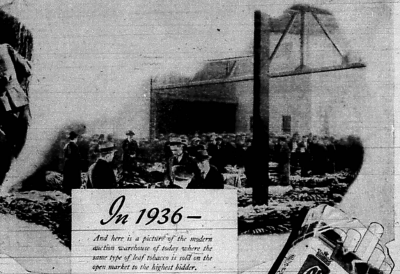
And here is a picture of the modern action warrens of today where the same type of leaf tobacco is sold on the open market to the highest bidder.